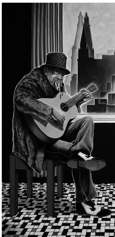
«Dissonance», detalle, 200 x 200 cm, óleo sobre tela, 2013.